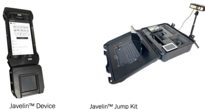
Figure 1. Handheld Javelin™ device (left) and the ruggedized Javelin™ Jump Kit (right).