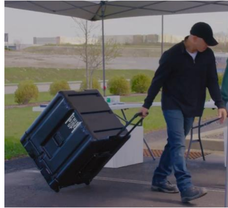
Figure 3. The RHID mobile transport case for field operations.