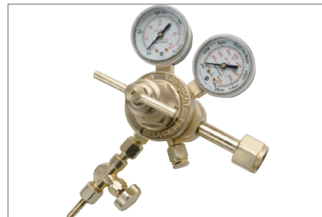
Fig. 03 | Two-stage CO 2 gas regulator