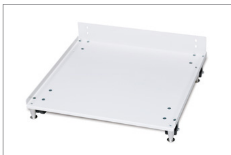
Fig. 04 | Roller base and stand