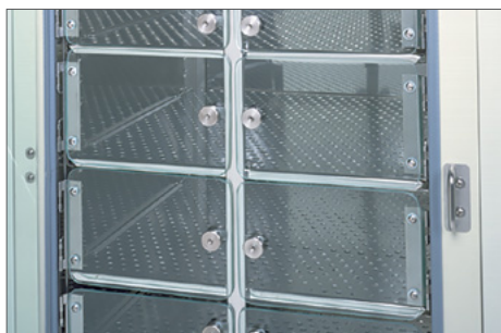
Fig. 01 | Inner glass door kit