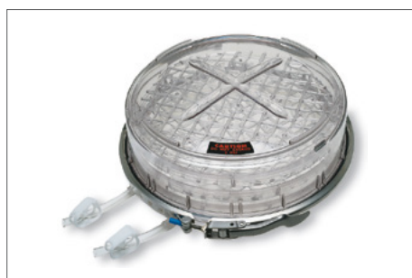
Fig. 05 | Sealed modular incubator chamber