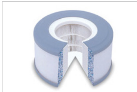
Fig. 02 | HEPA air-filter (VOC)