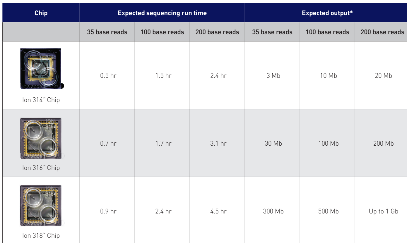
Table 1. The Ion PGM™ Sequencer continues to keep pace with scalability demands—3 Mb to 1 Gb.

*Expected output with >Q20 (>99%) aligned/measured accuracy and majority of bases ≥Q30. Paired end and mate pair sequencing protocols are available through the Ion Community.