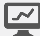
Analysis in HLA Fusion

One consistent workflow across all assay types reduces training time and increases efficiency.