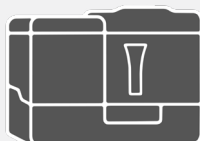
Detection via LABScan3D or LABScan 100